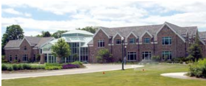
The Lodge was built in 2002.