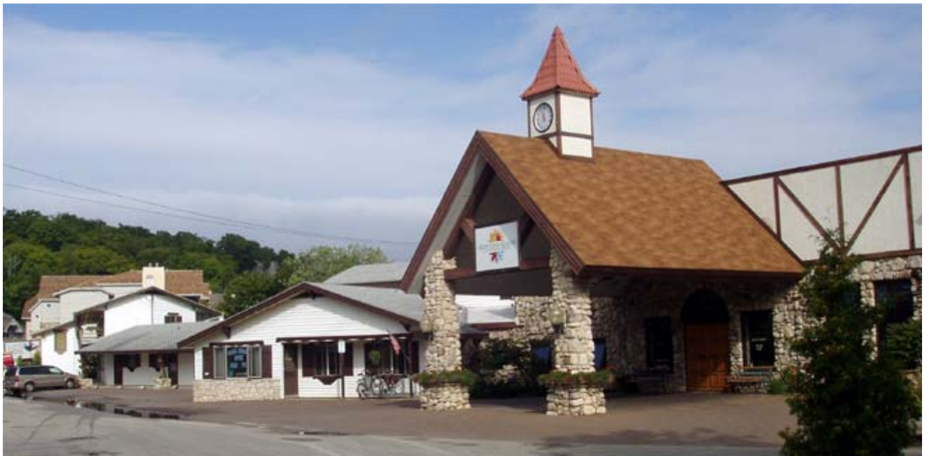
Helm's Four Seasons Hotel.