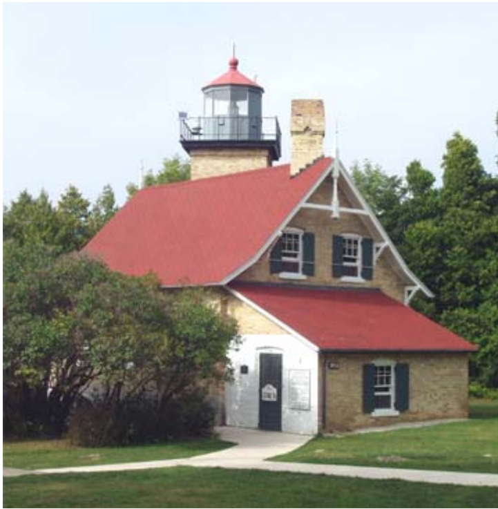
Eagle Bluff Lighthouse.