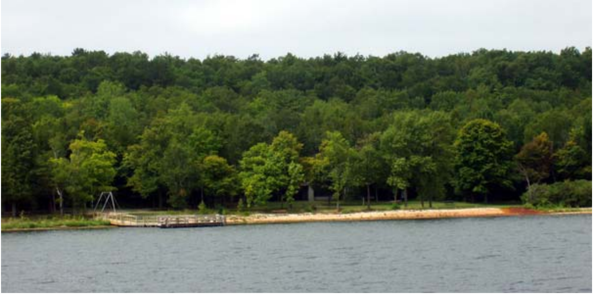
Potawatomi State Park.

The Captain keeps up a great narrative spiced with some corny jokes.