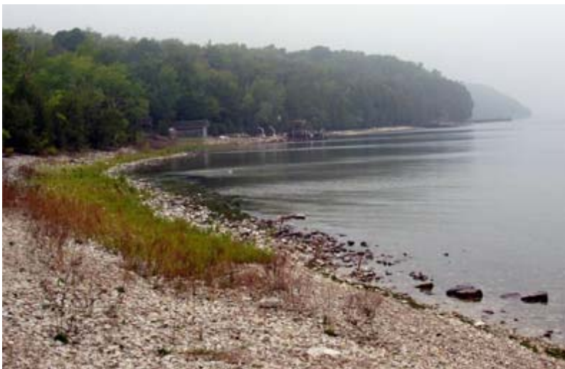
The Rocky Beach.

A blink and we pass through Ellison Bay. All the little towns we visit today post signs boasting populations of just two to three hundred (hardy) souls. They must only count year round residents.