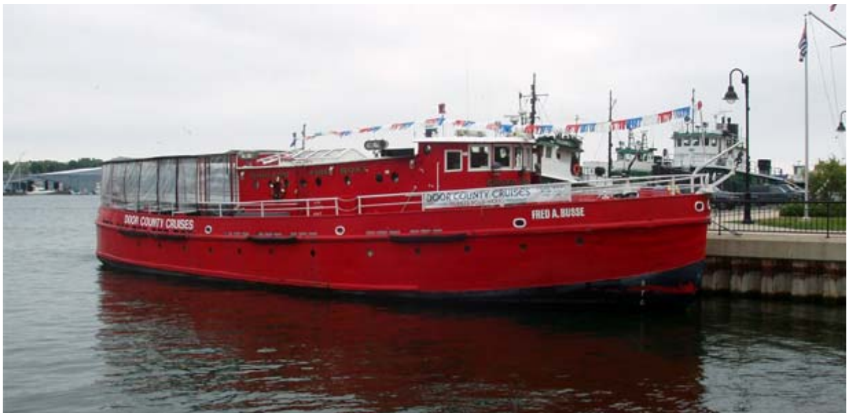
Our tour boat.