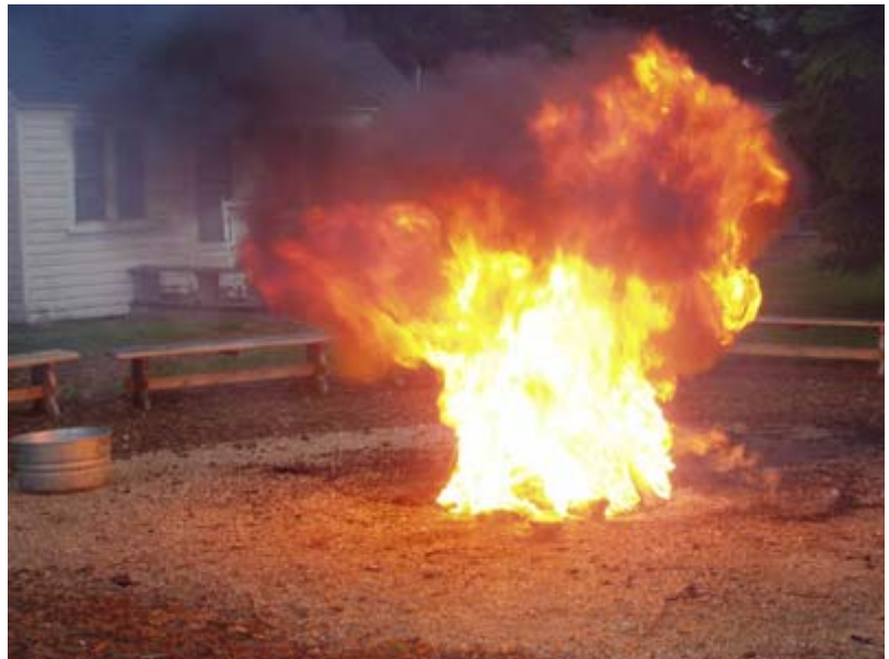
Fish Boil Finale.

We join a line inside and are served buffet style. Two large pieces of white fish, little round potatoes, a huge onion, slaw and fresh baked fancy bread. Waiters flit from table to table deftly removing the bones. The portions were enormous topped off by home baked cherry pie and ice cream.