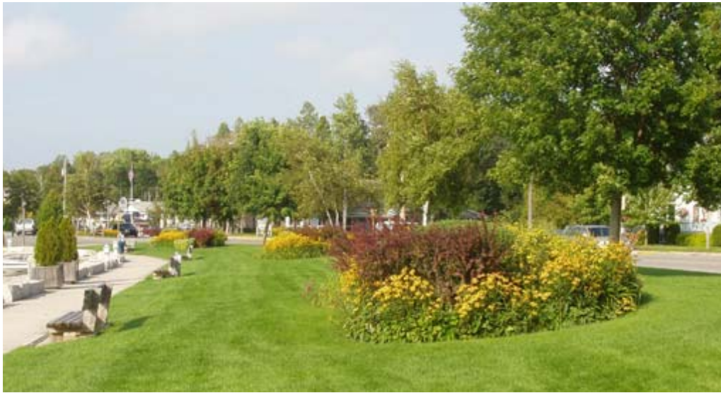
The front at Sister Bay.