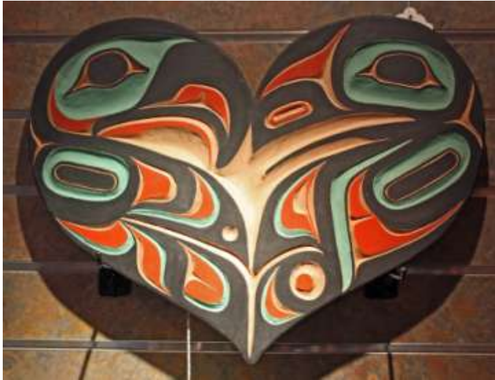
Eagle and Raven.