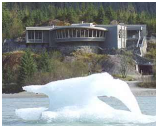
Mendenhall Visitor Center.