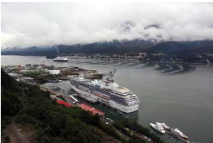
Juneau from Mt. Roberts.