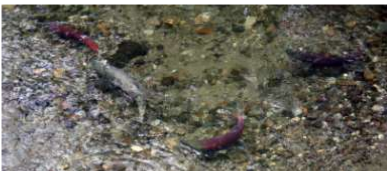
Salmon preparing to spawn.

Off we trot to the Mendenhall Glacier. Are we glaciated out? The Mendenhall terminates in a lake but has retreated 250ft in one year. A stream flows from the lake. In it we watch salmon preparing to spawn. The visitor center is an impressive concrete structure. A sample of glacial ice sits on a trolley for us to fondle.